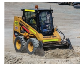
Skid Steer Loaders &amp; Attachments