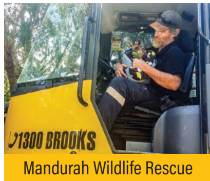
Mandurah Wildlife Rescue

We support many charity groups, voluntary organisations, community groups and sporting clubs at a grass roots level, fostering community spirit and engagement. From providing donations to lending our machinery, our involvement with the community stretches far and wide.