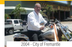
2004 - City of Fremantle