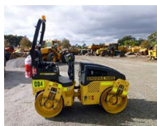
Double Drum Vibrating Rollers