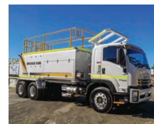
Service Trucks &amp; Trailers