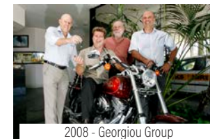
2008 - Georgiou Group