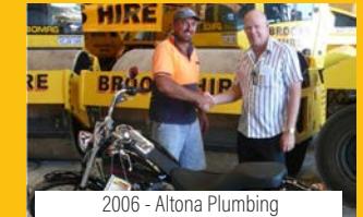
2006 - Altona Plumbing