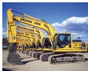
Excavators &amp; Attachments