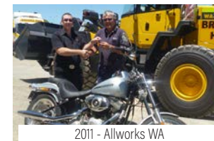
2011 - Allworks WA