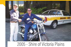
2005 - Shire of Victoria Plains