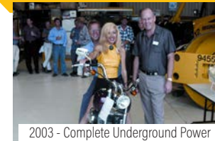
2003 - Complete Underground Power