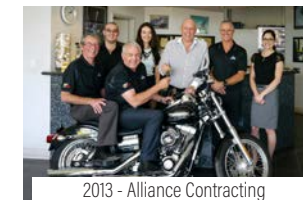
2013 - Alliance Contracting