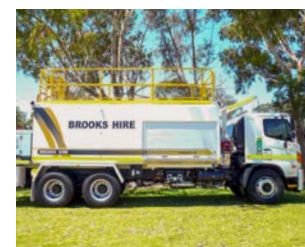
Fuel Trucks and Trailers