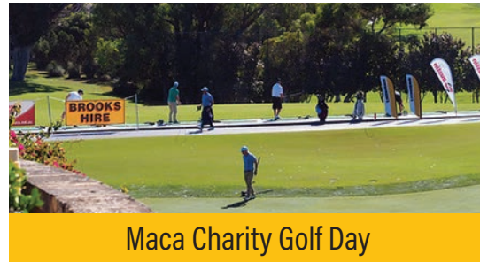
Maca Charity Golf Day

Proudly supporting our fellow Australians.