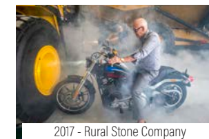
2017 - Rural Stone Company