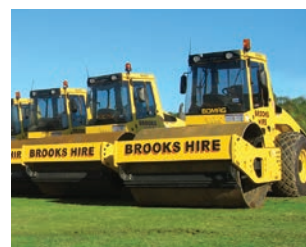
Smooth Drum Vibrating Rollers