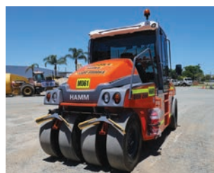
Multi Tyre Pneumatic Rollers