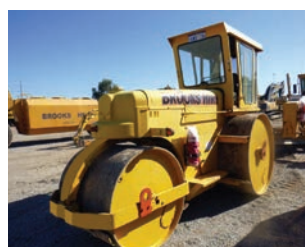
3 Pin Static Rollers