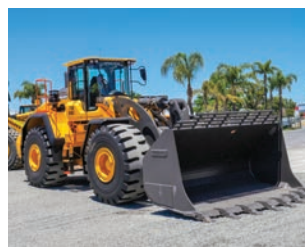
Wheel Loaders &amp; Tool Carriers