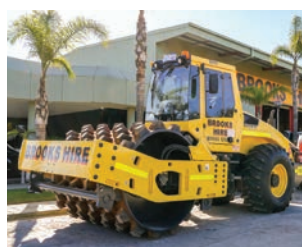
Padfoot Vibrating Rollers