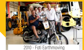
2010 - Foti Earthmoving