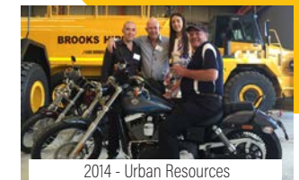
2014 - Urban Resources