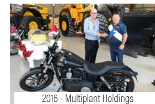
2016 - Multiplant Holdings