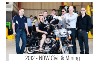
2012 - NRW Civil & Mining