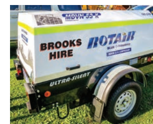
Pumps, Generators, Compressors etc.