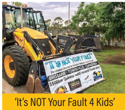
'It's NOT Your Fault 4 Kids'