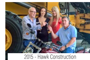
2015 - Hawk Construction