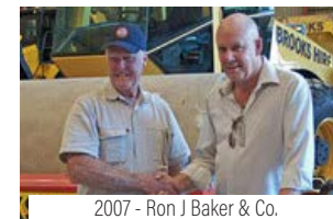
2007 - Ron J Baker & Co.