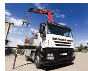
Freight Trucks &amp; Trailers