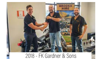
2018 - FK Gardner & Sons