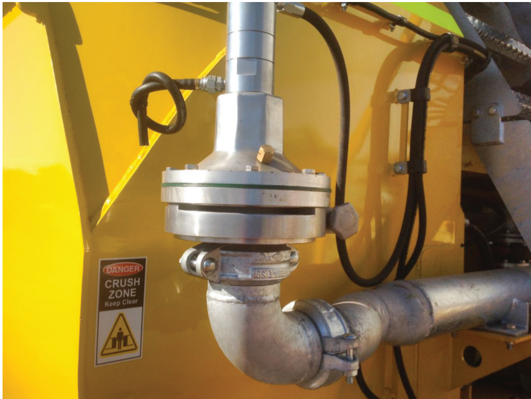
Victaulic mounted hydraulic spray heads