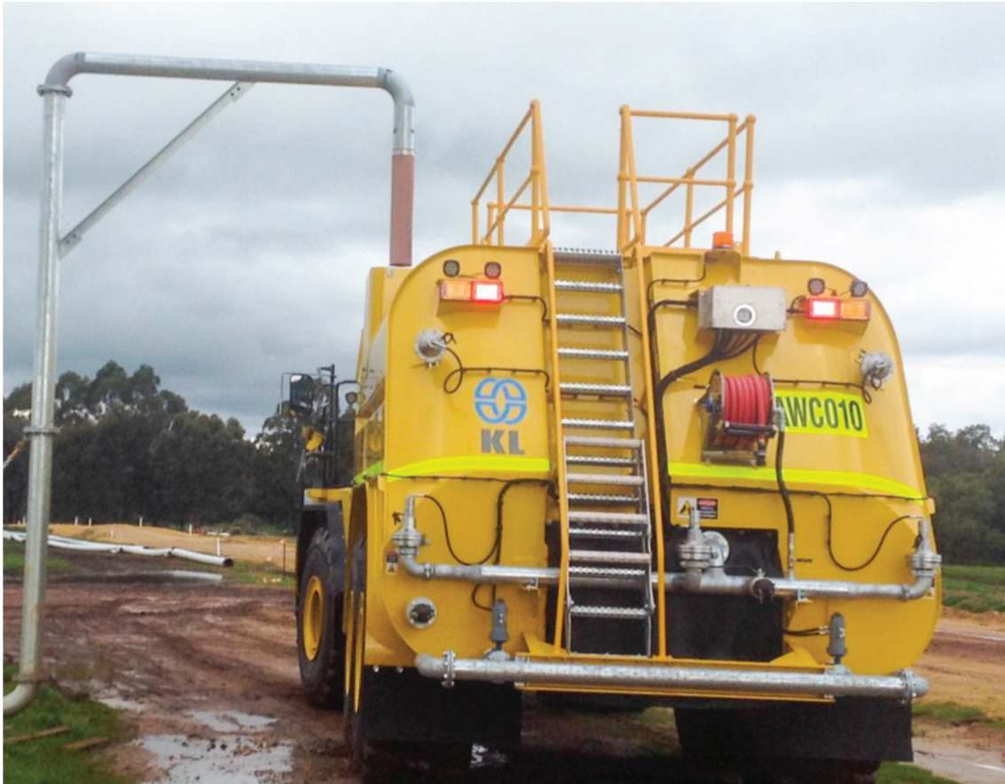
Rear view tank filling. Access ladder lower step folded.