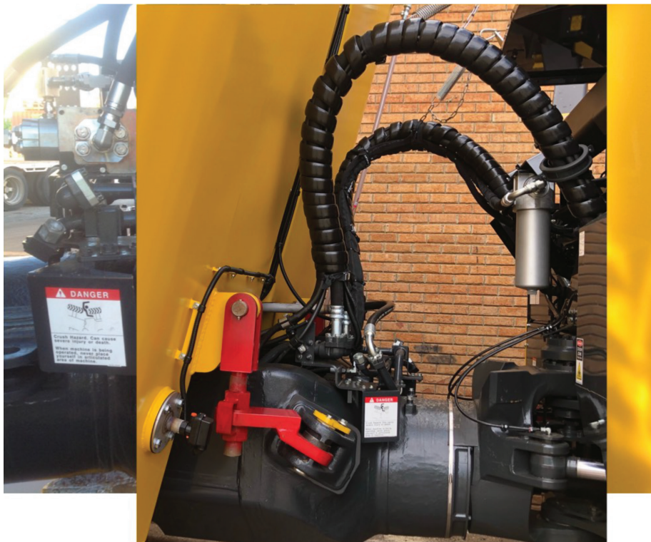
Front tank tie down and low level water switch. High flow return filter.