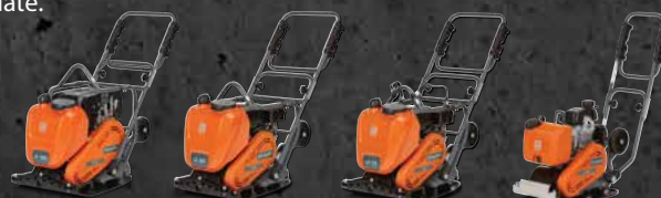
LF 100 LAT