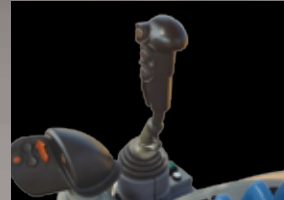
Mechanical control (Standard and Deluxe grade)