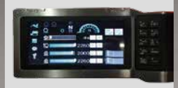
New 7" touch screen LCD monitor*