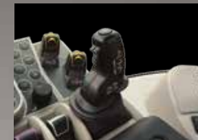
Electrical control (Premium and Premium KVT grade)