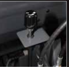
(Standard and Deluxe grade)

You no longer need to leave the cab to adjust the hydraulic flow rate. The flow rate adjustment dial is now conveniently located within easy reach from inside the cab, saving you time—and improving productivity—when setting up the tractor for various types of work.