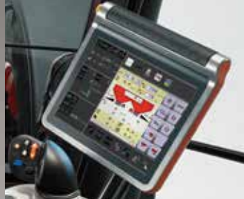
Large touch screen 12" LCD monitor*